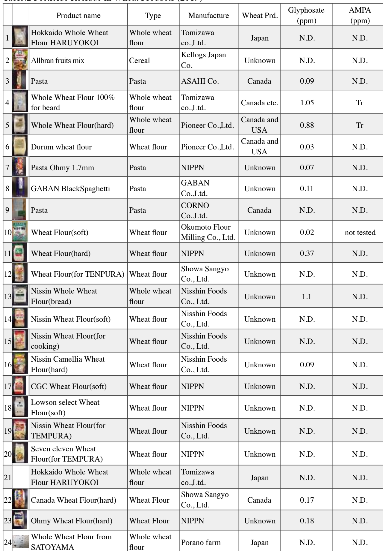
Table.2 Pesticide Residue in Wheat Products (2019)